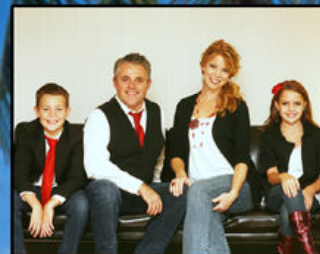
THE SILER FAMILY