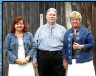
PAUL JAMES SOUND